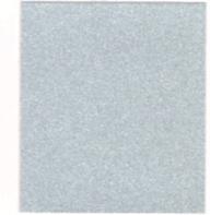
CHAMPAGNE METALLIC PVDF 3