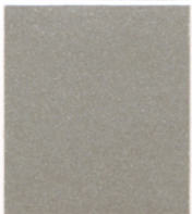
HARVEST GOLD MICA PVDF 2