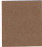
HAZELNUT MICA PVDF 2/SRI 40