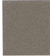
DRIFTWOOD MICA PVDF 2/SRI 40