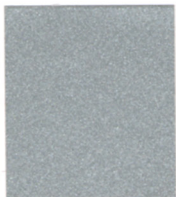
WEST PEWTER MICA PVDF 2