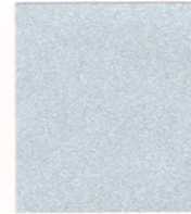
SILVER METALLIC PVDF 3/SRI 58