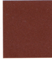
RUSSET MICA PVDF 3/SRI 38