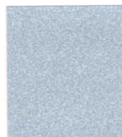
BRILLIANT SILVER METALLIC PVDF 3/SRI 73