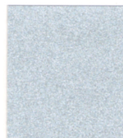
SUNRISE SILVER METALLIC PVDF 3/SRI 30