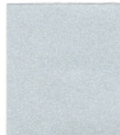
ANODIC CLEAR MICA PVDF 2