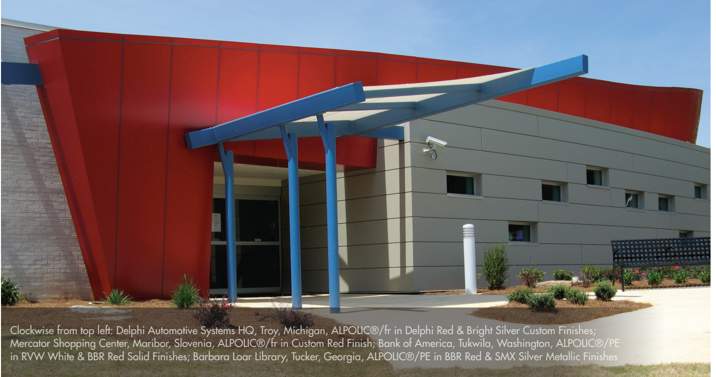
Clockwise from top left: Delphi Automotive Systems HQ, Troy, Michigan, ALPOLIC®/fr in Delphi Red & Bright Silver Custom Finishes; Mercator Shopping Center, Maribor, Slovenia, ALPOLIC®/fr in Custom Red Finish; Bank of America, Tukwila, Washington, ALPOLIC®/PE in RVW White & BBR Red Solid Finishes; Barbara Loar Library, Tucker, Georgia, ALPOLIC®/PE in BBR Red & SMX Silver Metallic Finishes