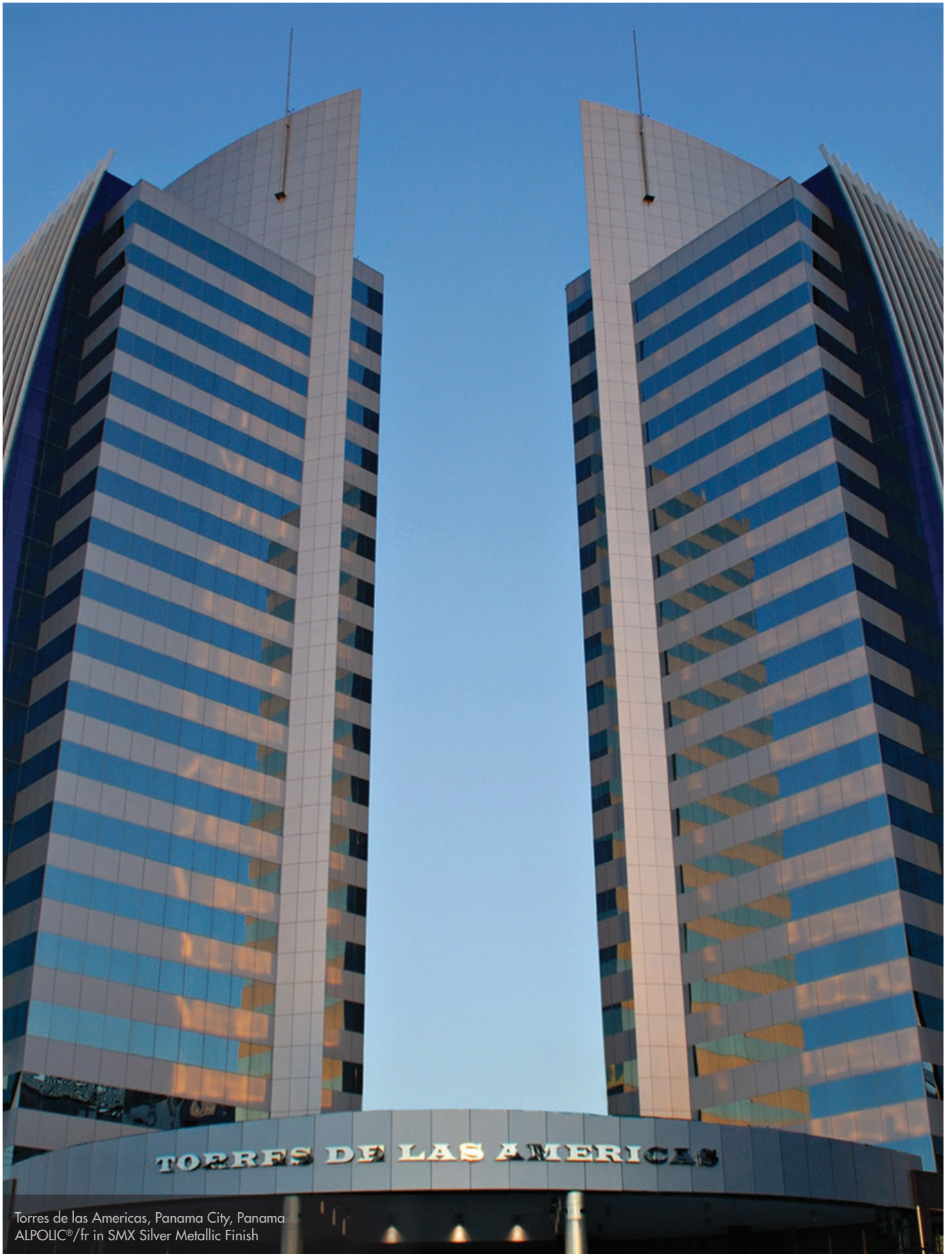
Torres de las Americas, Panama City, Panama ALPOLIC®/fr in SMX Silver Metallic Finish