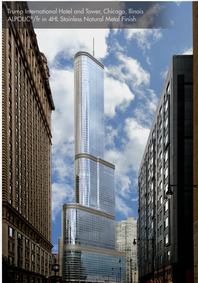
Trump International Hotel and Tower, Chicago, Illinois ALPOLIC®/fr in 4HL Stainless Natural Metal Finish

Your project's potential. Your technical requirements. Your practical needs. We understand your ideal. Let's make it real. Let's build.