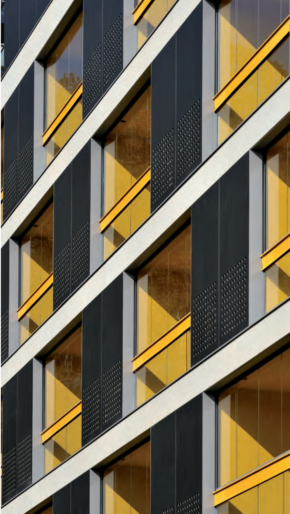
SLOVENIA Pilon Housing, Ljubljana