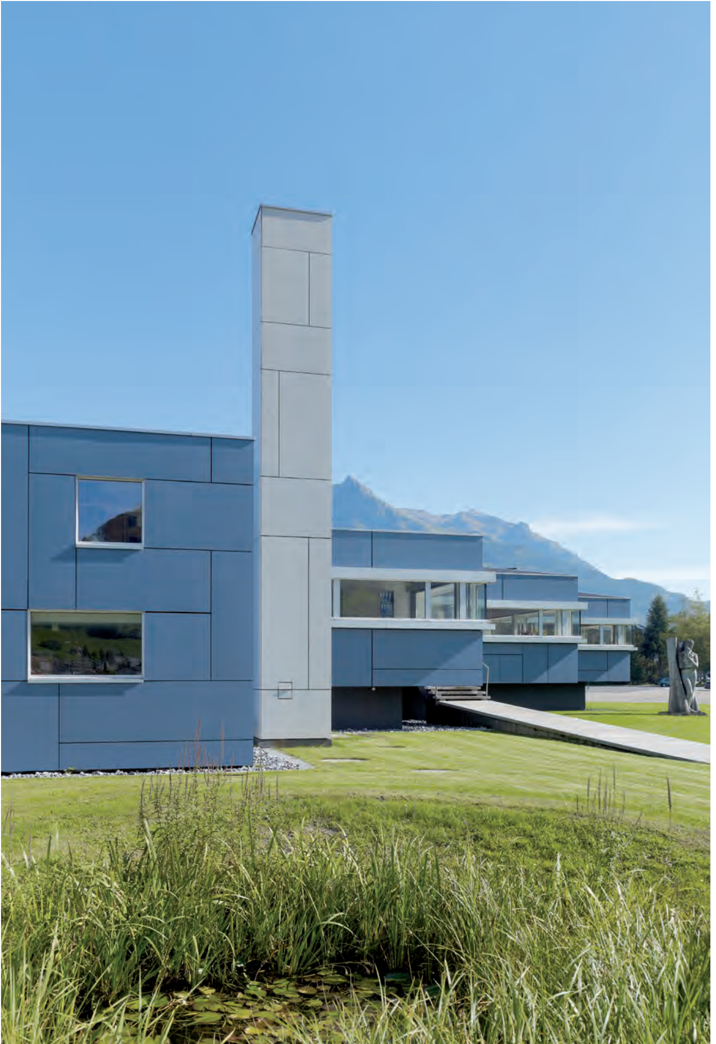
SWITZERLAND Office Building, Niederurnen