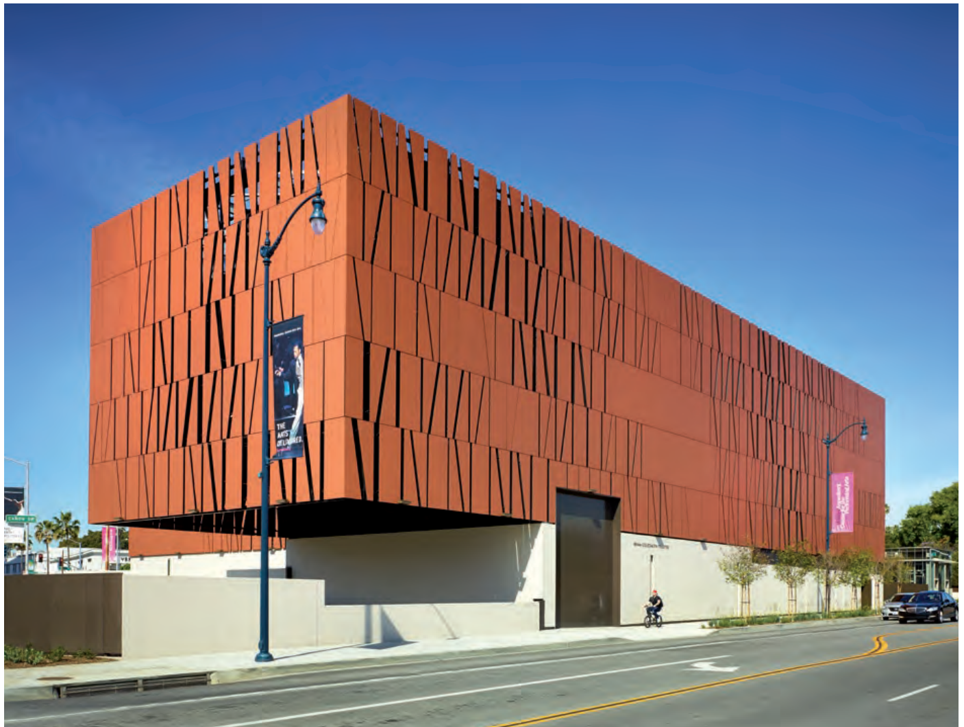
USA Wallis Annenberg Center for the performing arts, Beverly Hills