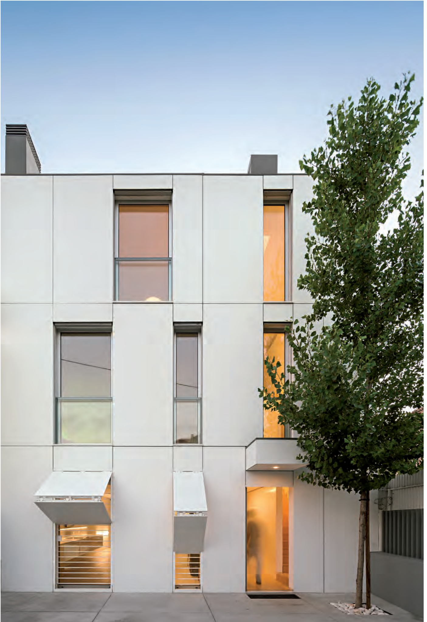
PORTUGAL Single-family House, Parede near Lisbon