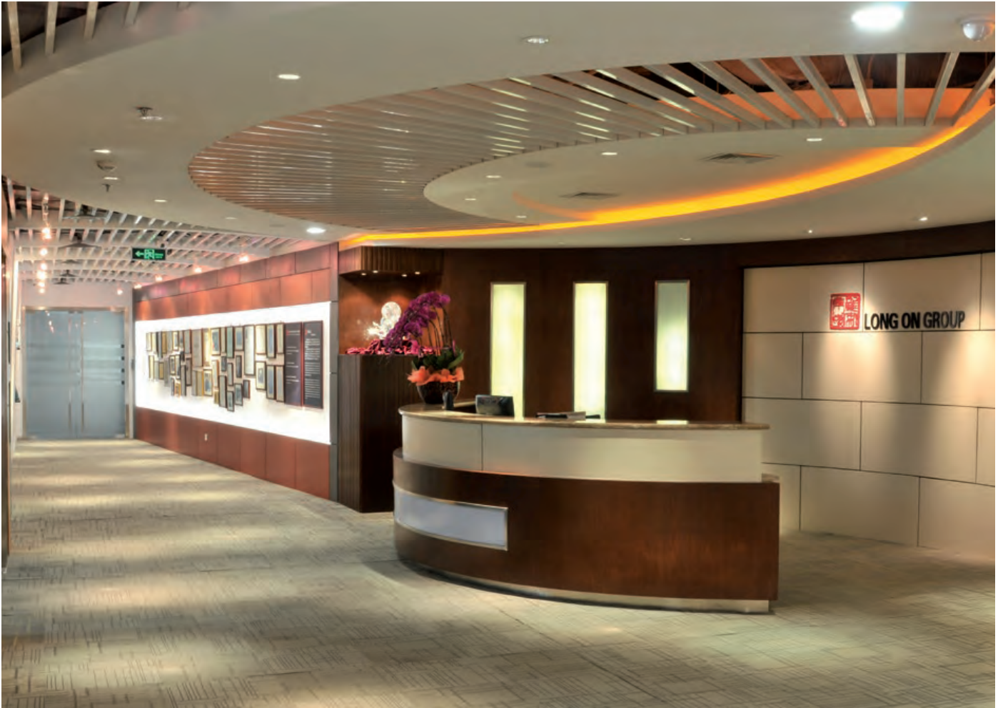
CHINA Office reception area, Beijing