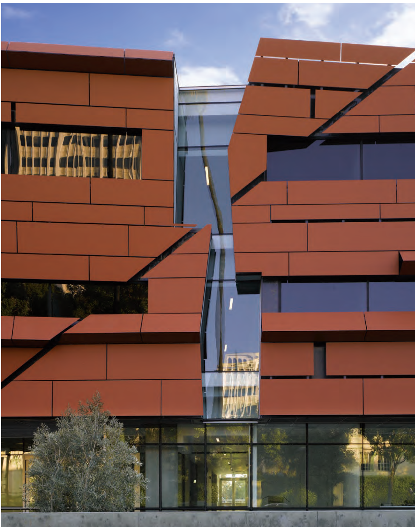
USA Cahill Center for Astronomy and Astrophysics, Pasadena