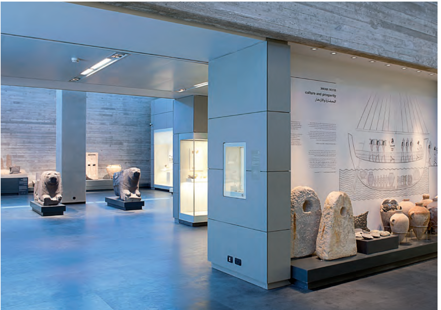
ISRAEL Archaeology Wing of the Israel Museum, West Jerusalem