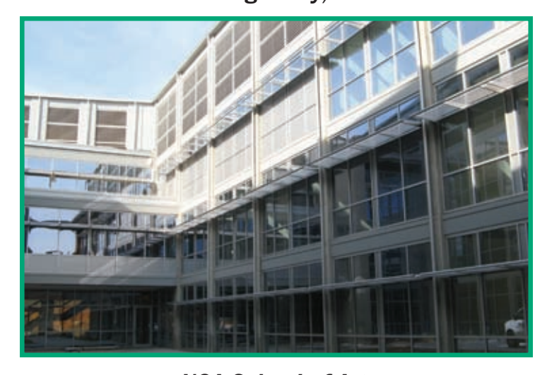
UGA School of Art Athens, GA