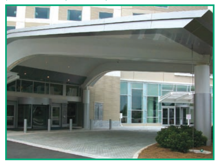
Marriott Gateway Canopy College Park, GA