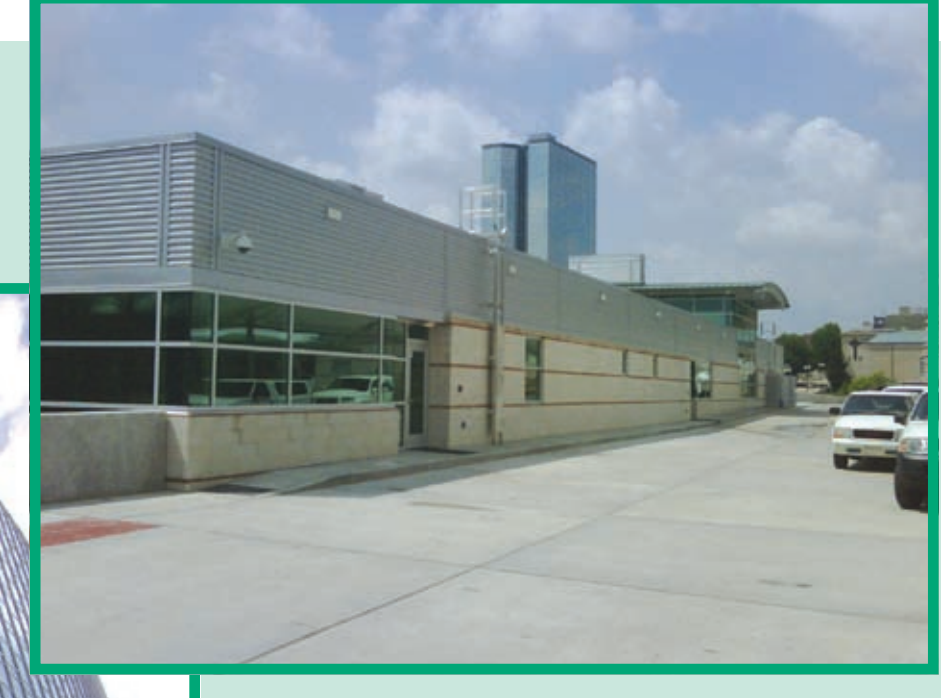
Knoxville Station Transit Center Knoxville, TN