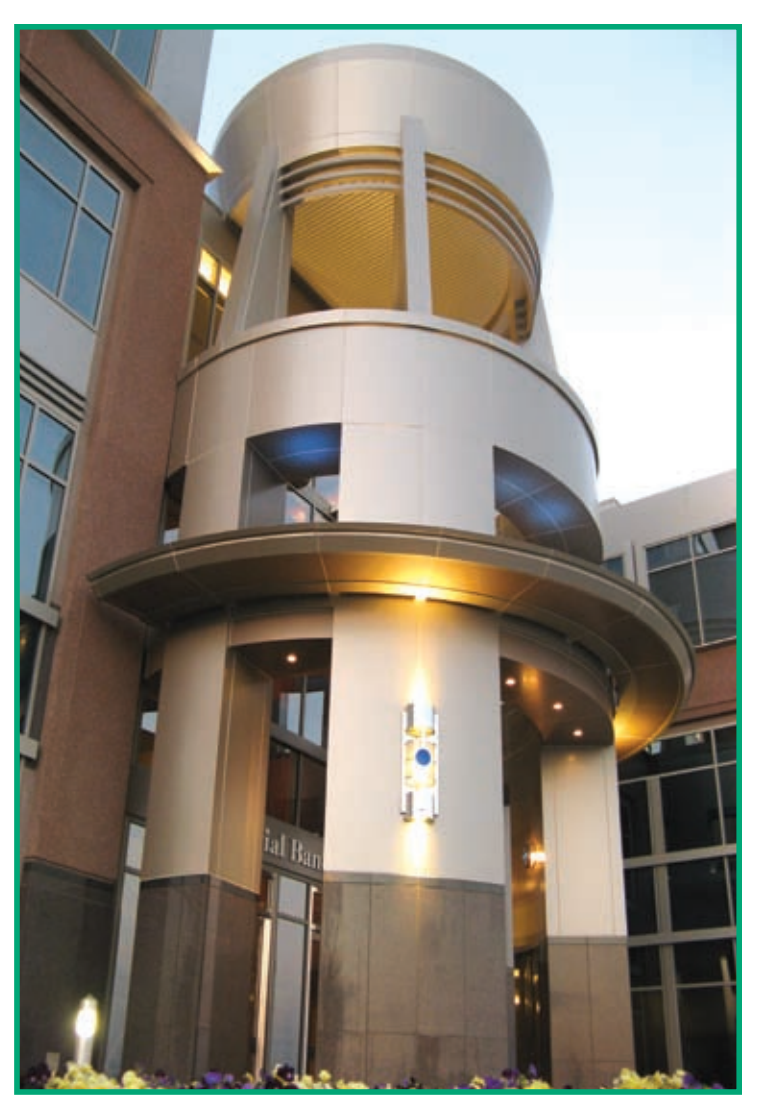
Colonial Bank Montgomery, AL